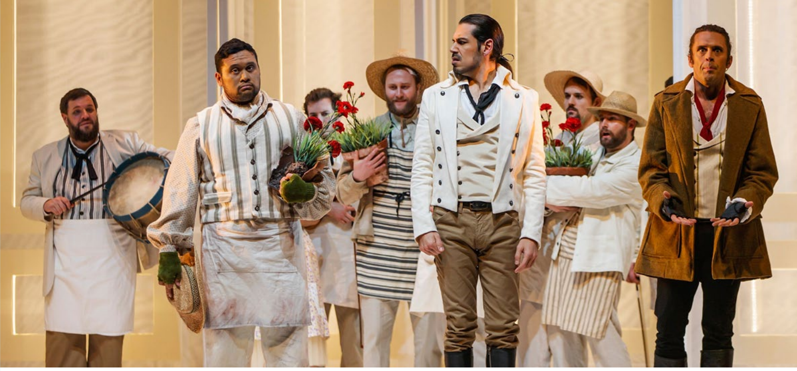
New Zealand Opera Ltd.