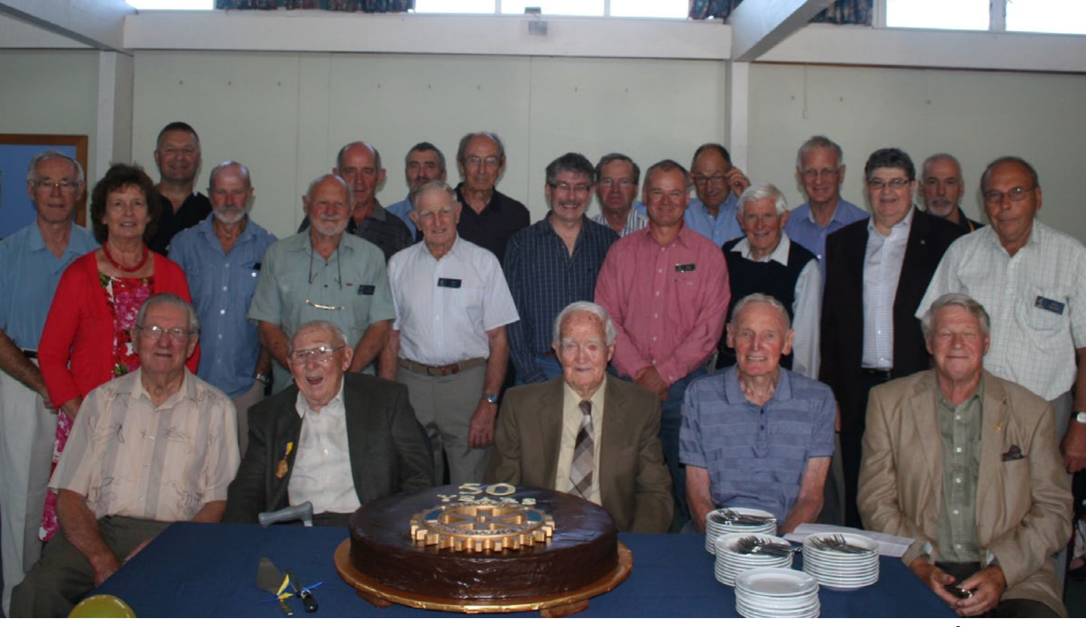
Celebrating 50 years of the Rotary Club of Ōtaki. 2014.